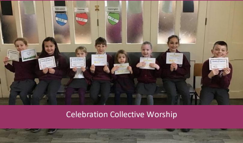
Celebration Collective Worship

96% Whole School Attendance (Wrexham 94%)