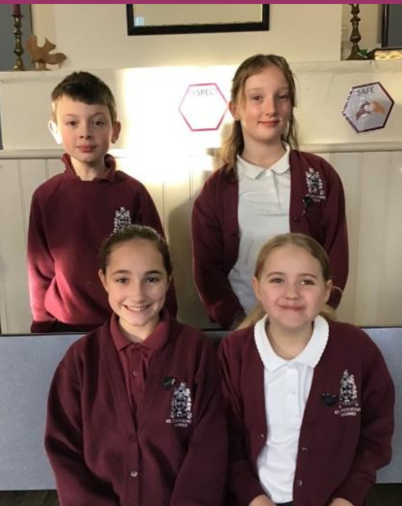
Introducing our new Prefects!

To book a session please email ASC at afterschoolclubhanmer@gmail.com