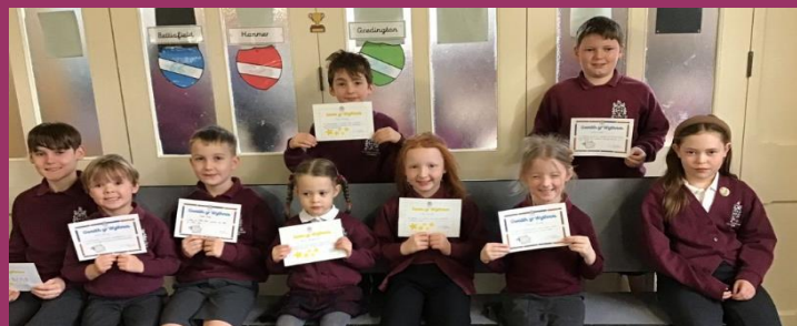
Celebration Collective Worship