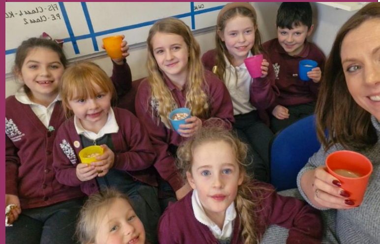
Hot Chocolate for our pupils who gained a Headteacher Award last half term.

99% Whole School Attendance (Wrexham 94%)